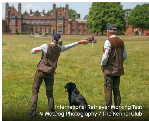
International Retriever Working Test

For more information on The Kennel Club 150 th Anniversary test please read the report by Welsh Team Captain Alan Rees later on in this issue.