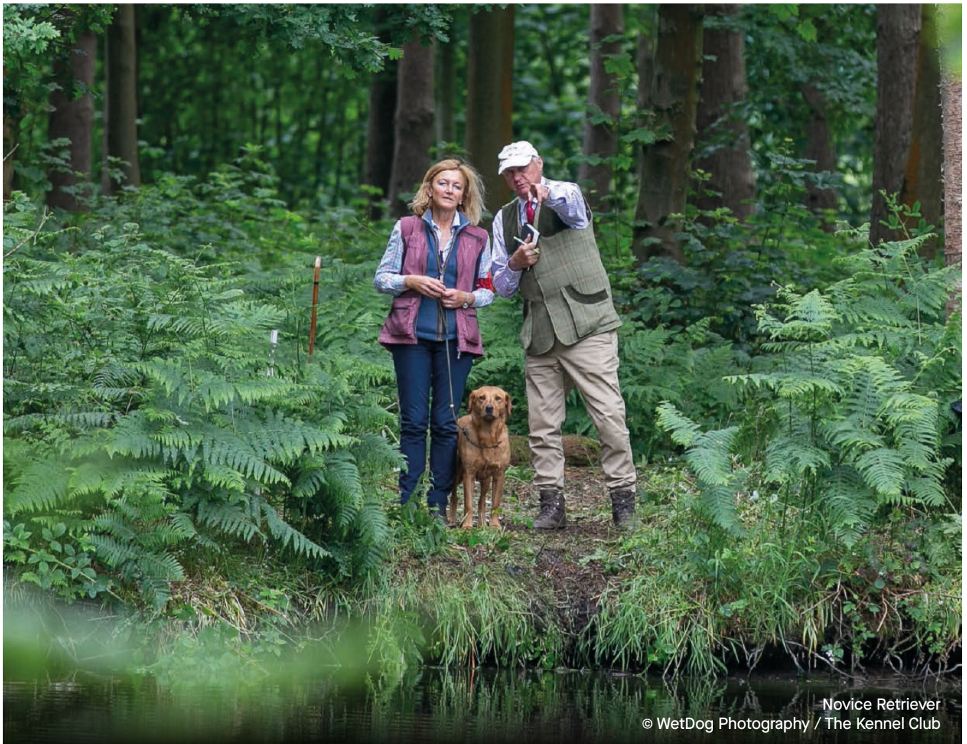
Novice Retriever

This year's working test also featured a very special 150 th Anniversary Competition whereby teams of two retrievers, two spaniels and one Hunt, Point and Retrieve breed all worked together to show off their hunting, marking and retrieving skills as a team. An event of this style has never been undertaken before and was heralded as a credit to The Kennel Club.