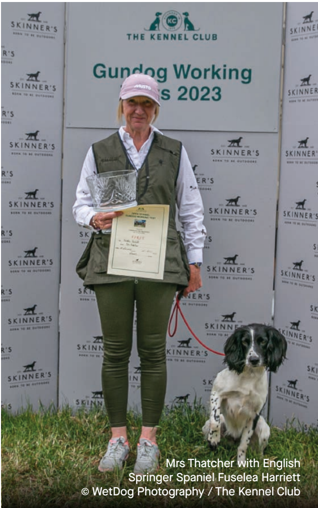
Mrs Thatcher with English Springer Spaniel Fuselea Harriett