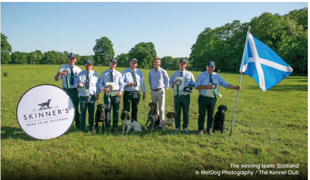
The winning team: Scotland