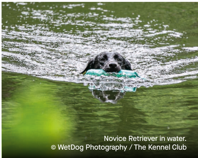
Novice Retriever in water.

The Gundog Working Test Working Party were assisted by Kennel Club Staff and numerous volunteers, to manage the event. The Working Test Working Party had dedicated a huge amount of time and effort into setting the challenging and exciting tests for all the breed groups, and many competitors commented on the standard of the test scenarios. Whilst the weather across the five days was warm, all dogs were given plenty of rest breaks and ample opportunities to enter water throughout the event.